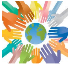
USCCB & CRS

The world was made by God, so we take care of all creation.